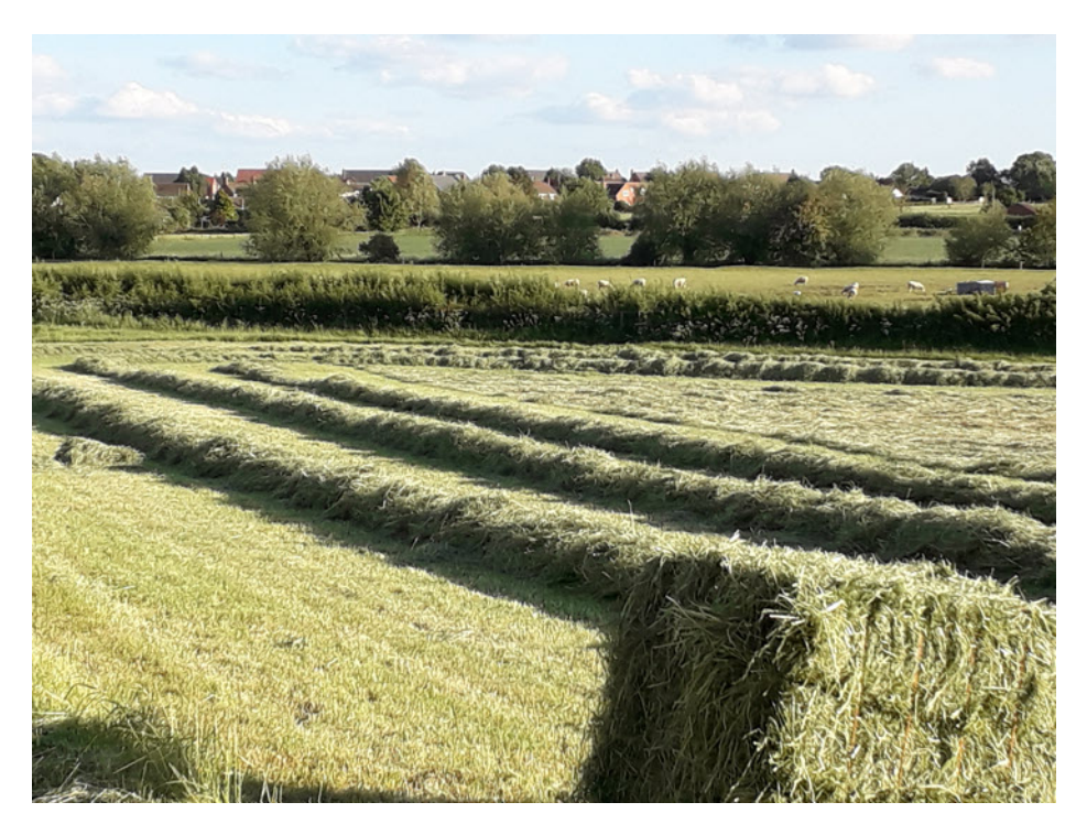
Looking back towards Oxhill from Nolan's Lane